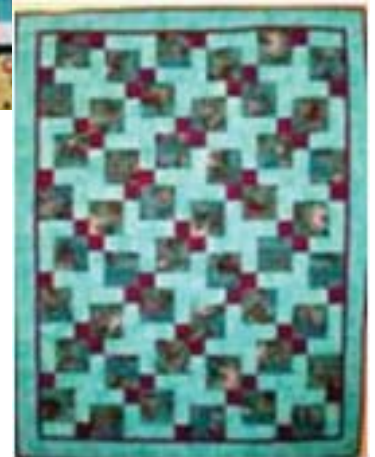
Quilt 2 (right) made from 3 fabrics