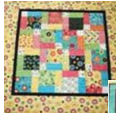
Quilt 1 (above) made with Charm Packs